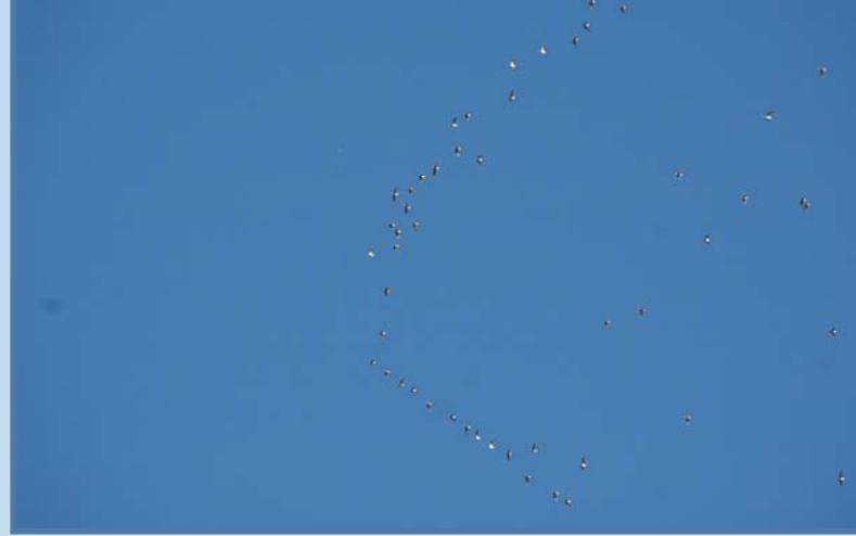
Golden plovers in flight, photo taken from Barry's garden

Another long-distance migrant that can be found locally is the Golden Plover. The British breeding population can be found on moorland in the North of England and Scotland but in the winter we get huge numbers of birds from the far north. These birds will usually spend the winter on marshes but can also be found on farmland.